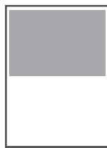
2" x 3" Half Page No Bleed $350

Please purchase your ad through the "PURCHASE AD" button below by no later than April 14, 2024. Provide high resolution print-ready PDF, JPG, or PNG files at 300–350 dpi according to the specs listed below: